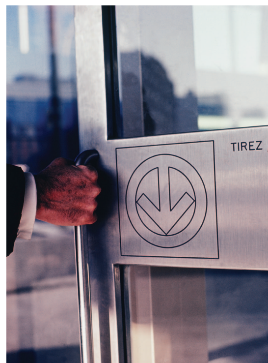
Montréal Métro Book and Exhibition/

Revenue Canada now offers a new way to donate to charities. You can donate securities to our BMO Nesbitt Burns account. Canadians receive preferential tax treatment in donating securities that have appreciated in value. This is due to recent tax legislation that eliminates capital gains tax on such securities.